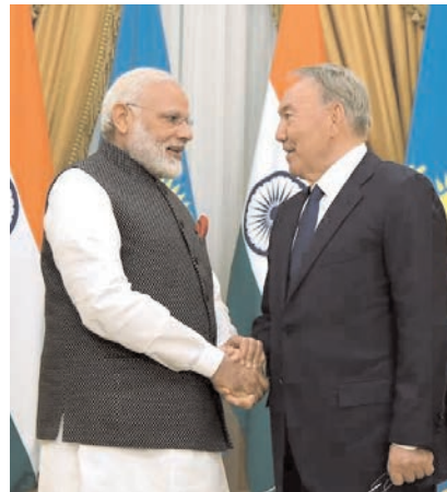
Prime Minister Narendra Modi and Kazakhstan's President Nursultan Nazarbayev in Astana

“Indo-Pak relations have a more complex pathology for their downward spiral. Modi came to power wanting to break the old cycle of talks and terror. He chose theatrical and personalized engagement with Sharif to leap over the complexities constricting a Pakistani leader, ranging from his relations with the army to pressure by jihadis with vote banks, and finally, his own credibility after the Panama Papers revelations”, says the author