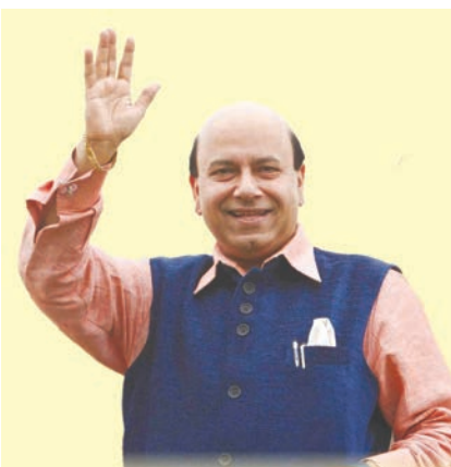
Vijay Jolly is leading a 12-member International Poll Observers Delegation to monitor Cambodian parliamentary polls

Indian BJP Leader Vijay Jolly leading ICAPP, launched in 2000, is a global political organization with members of 360 political parties drawn from 53 countries in Asia. They promote exchanges, cooperation & mutual understanding between citizens of Asia,