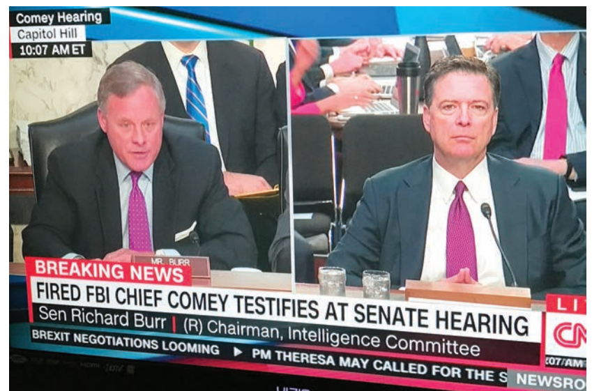
Fired FBI Director James Comey testified before the Senate Intelligence Committee, June 8, 2017. Seen to his right is Committee Chairman Richard Burr, Republican of North Carolina