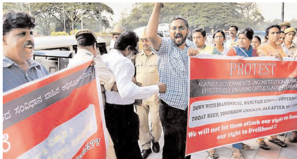
Activists protesting in Bengaluru last week against the Central government's notification banning sale and purchase of cattle for slaughter.

The legislation purporting to be for the prevention of cruelty to animals is a ploy to snatch jurisdiction by the Centre on the subject of cattle trade, which is squarely the purview of the states. Even the BJP accepts this, as is clear from the Arunachal Pradesh state party president openly announcing that the Centre's ban on the sale of cattle for slaughter could not be binding on the states. The entire North-East is on the boil on this matter.