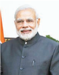
India's PM Narendra Modi is expected to meet President Trump later this month

Modi is expected to travel to Washington at the invitation of US President Donald Trump for a meeting at the White House later this month. Actual date of the meeting has not been announced yet.