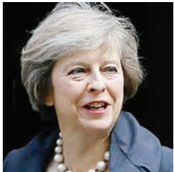
Theresa May refuses to quit despite hung parliament

LONDON (TIP): With 646 of 650 results out, it is now clear no party has the majority to form the government. As things stood on Friday morning, the Conservatives had won 314 seats, a loss of 12, while Labour had won 261, a gain of 29.