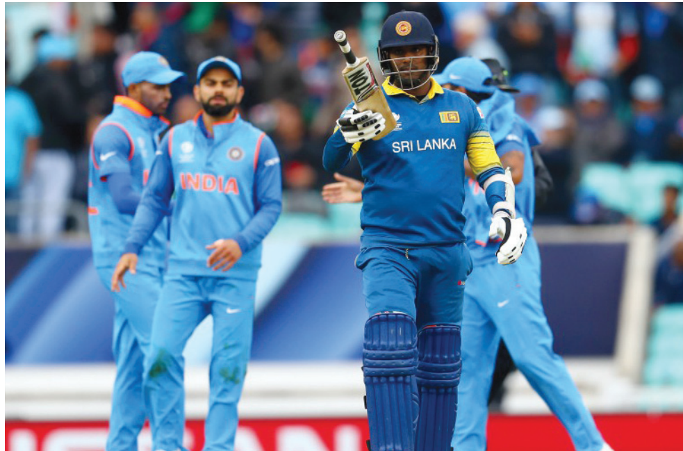
Angelo Mathews led Sri Lanka home, India v Sri Lanka, Champions Trophy 2017, The Oval, London, June 8, 2017.

Chasing 322 to stay alive in ICC Champions Trophy 2017, Sri Lanka gunned down the target with seven wickets in hand. The win over India makes the Group B very interesting now. Winner of India vs South Africa, Pakistan vs Sri Lanka to enter semis.