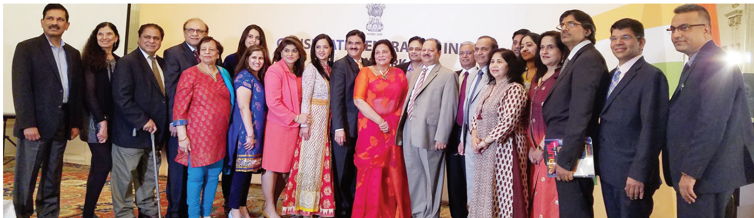
AAPI leadership and committee members

Many of the physicians who will attend this convention have excelled in different specialties and subspecialties and occupy high positions as faculty members of medical schools, heads of departments, and executives