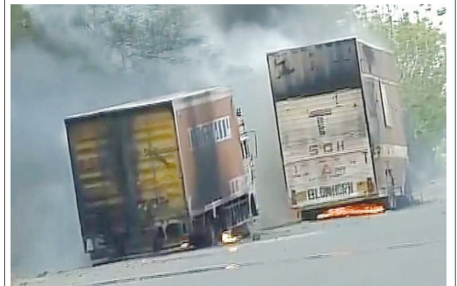
Madhya Pradesh farmers burn vehicle after protest.