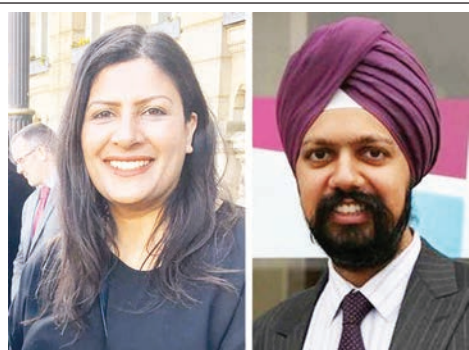
Preet Kaur Gill and Tanmanjeet Singh Dhesi.