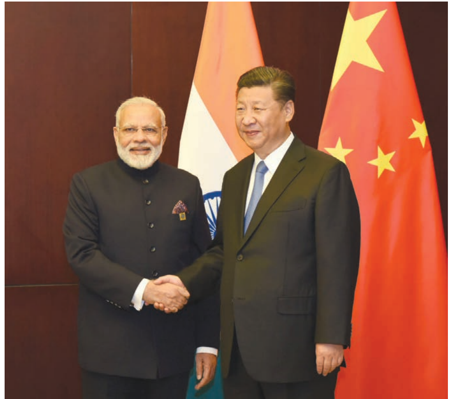
Prime Minister Narendra Modi meeting the President of the People's Republic of China, Xi Jinping, on the sidelines of the SCO Summit, in Astana, Kazakhstan on June 9, 2017.