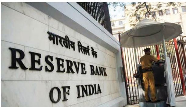
The central bank, however, kept monetary policy stance 'Neutral' over uncertainty over monsoon.

MUMBAI (TIP): In an attempt to propel economy ahead of the General Election, the RBI on Thursday lowered the benchmark interest rate by 25 basis points (bps) to 6 per cent, the second cut in a row, to the lowest level in one year on softening inflation.