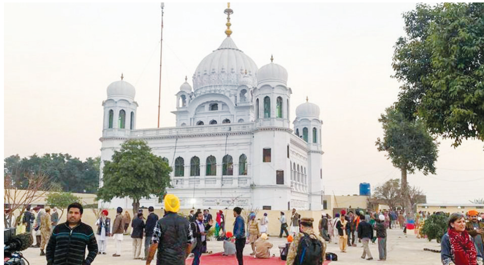
Darbar Sahib gurdwara in Kartarpur, Pakistan.

Sources had said India would wait for a response from Pakistan on the issue and was