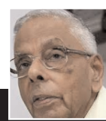
By M.K. Narayanan