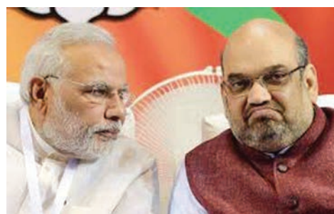
Prime Minister Narendra Modi and BJP President Amit Shah- all out bid to retain the title

India's biggest voting bloc. Modi promised to double agrarian incomes by 2022, but the farm sector has been hurt by bumper harvests and declining commodity prices. Farmers have staged enormous protests across India's biggest cities demanding loan waivers and guaranteed crop prices. Both major parties have rolled out welfare measures, with the BJP promising direct cash transfers and the Congress proposing a guaranteed minimum income of Rs.72000 ($1000) yearly for the poorest Indians.