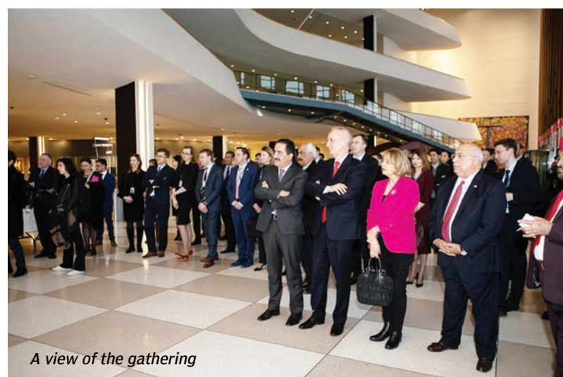
A view of the gathering