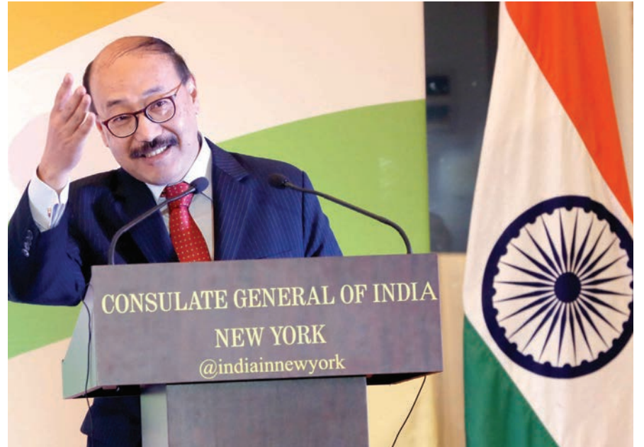
Jaipur Foot "gives a lease of life to people. Over 1.75 million have been touched by it", said Ambassador Harsh Vardhan Shringla