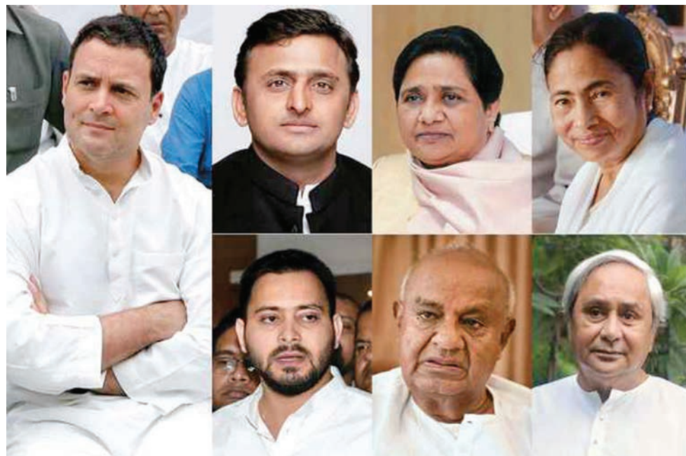
Principal challengers: (Clockwise)- Rahul Gandhi, Akhilesh Yadav, Mayawati, Mamata Banerjee, Yadav, Dave Gowda, Biju Patnaik