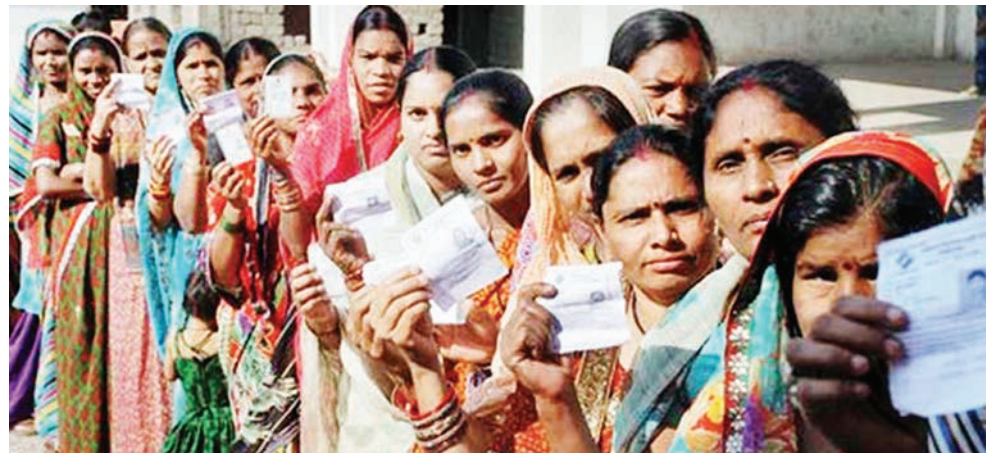
Voters at an election station in 2014 general elections