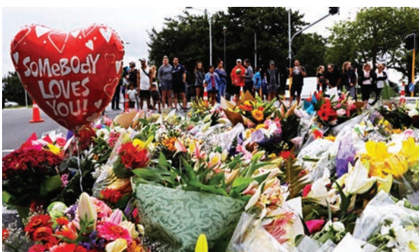
Mourners pay their respects at a makeshift memorial near the Masjid Al Noor mosque in Christchurch, New Zealand, Saturday, March 16, 2019.

WELLINGTON (TIP): The man accused of carrying out the Christchurch mosque attacks will face 50 murder charges and 39 attempted murder charges when he makes his second court appearance, the New Zealand police said on Thursday, April 4.