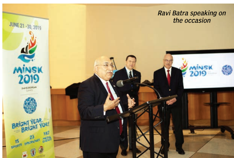
Ravi Batra speaking on the occasion

Present on the occasion, among others, were India's Permanent Representative to the United Nations Ambassador Syed Akbaruddin and Minister Deepak Misra.