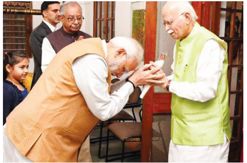
LK Advani, who is the longest serving BJP president, said that 'Nation First, Party Next, Self Last' has been the guiding principle of his life.

president, said that 'Nation First, Party Next, Self Last' has been the guiding principle of his life and had tried to adhere to this principle in all situation of life.