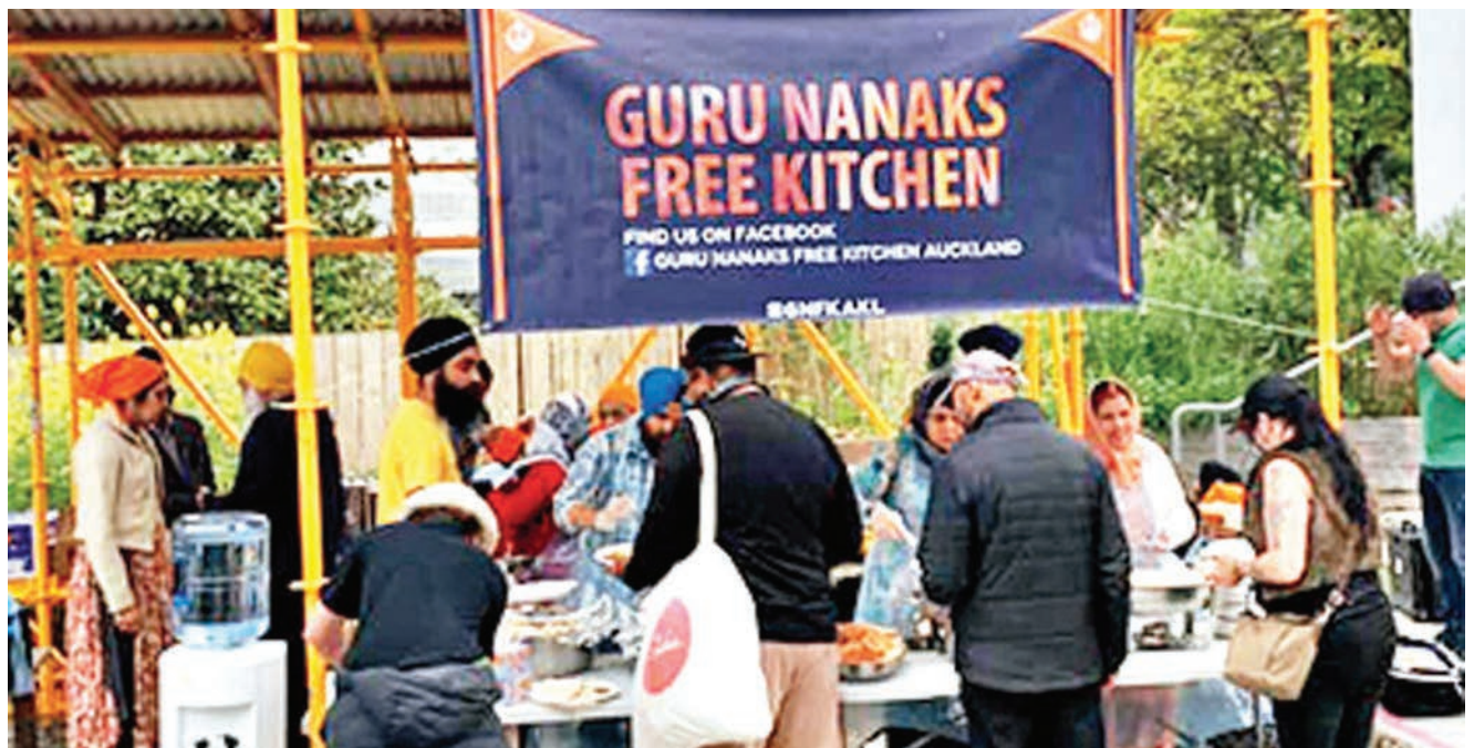
Guru Nanak's Free Kitchen, Auckland