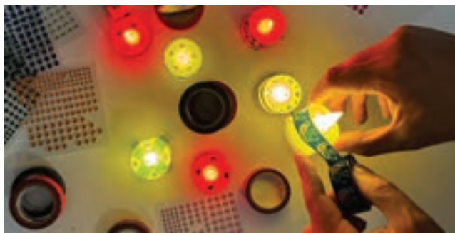
South Street Seaport Museum