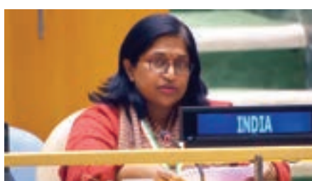
India's Deputy Permanent Representative Yojana Patel delivers the explanation of India's vote at the U.N. General Assembly's Emergency Special Session on October 27, 2023.

OCTOBER 28, 2023 NEW DELHI / NEW YORK (TIP): The government defended its decision to abstain in a U.N. General Assembly vote on resolution that called for a humanitarian truce and ceasefire in Gaza, saying it did not include "explicit condemnation" of the