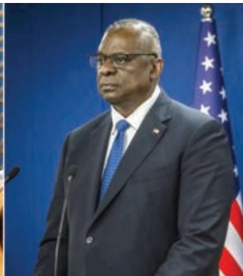
Antony Blinken (left) and Lloyd Austin.