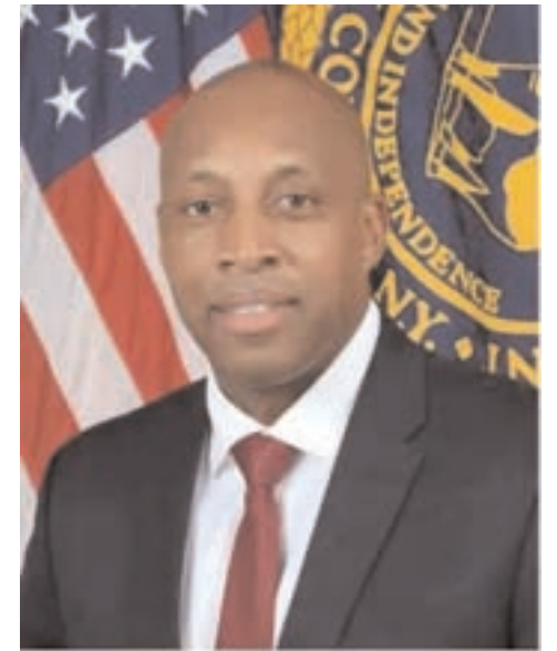
Suffolk County Police Commissioner Rodney Harrison