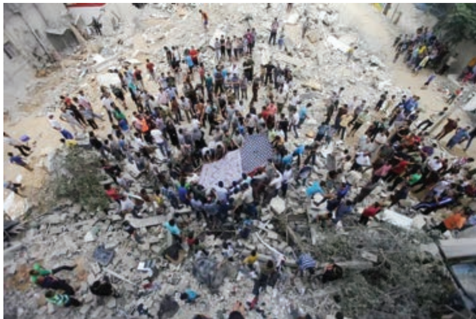
Continuing bombardment of civilian homes in Gaza amounts to war crimes, Amnesty International said.

Israel's construction of a separation barrier, annexation of East Jerusalem, and imposition of restrictions on Palestinian movement have further undermined the prospects for Palestinian statehood.