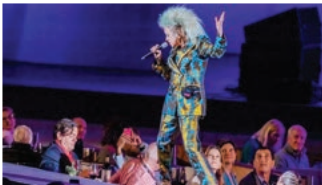
'Let The Canary Sing,' Opening Night film

OPENING NIGHT ● Parkway Theater ● Wednesday, November 8, 2023