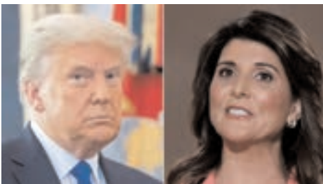
The Republican frontrunners Donald Trump and Nikki Haley