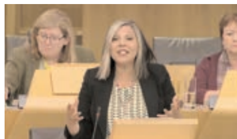
Scottish Parliament recognizes the Sikh Genocide of 1984 in India as "Anti-Sikh Violence"