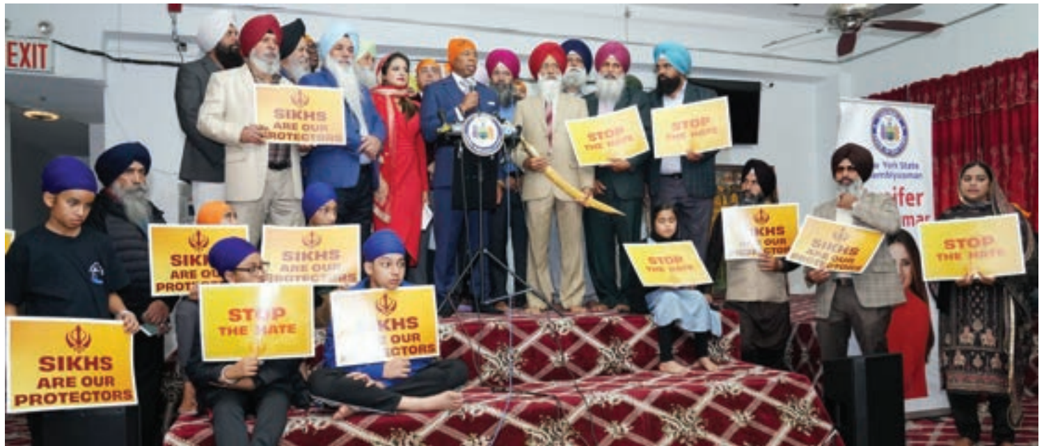
The Sikh turban does not mean terrorism but symbolizes faith, New York City Mayor Eric Adams said.