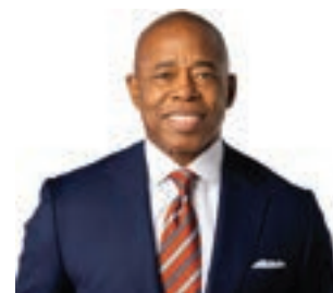
Mayor Eric Adams

NEW YORK (TIP): Federal prosecutors and the F.B.I. are conducting a broad corruption investigation into whether Mayor Eric Adams's 2021 election campaign conspired with the Turkish government to receive illegal foreign donations, according to New York Times which claimed it was in possession of a copy of the search warrant.