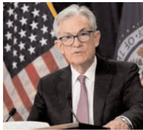
Fed Chair Jerome Powell

"We're not confident that we haven't, we're not confident that we have" reached that sufficiently restrictive plateau, Powell told reporters. "Inflation has been coming down, but it's still running well above our 2% target ... A few months of good data are only the beginning of what it will take to build