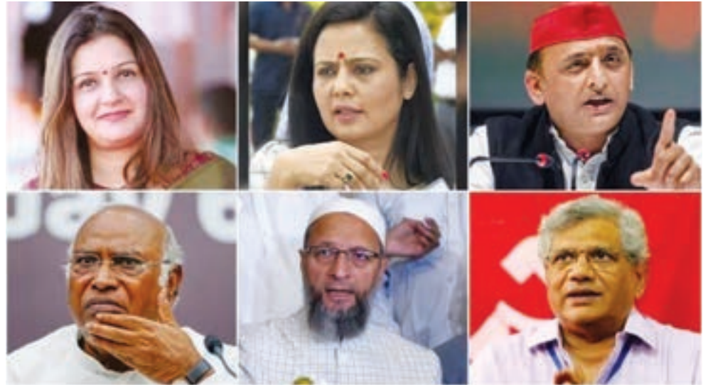
Several in Opposition, including Priyanka Chaturvedi, Mahua Moitra, Akhilesh Yadav, Mallikarjun Kharge, Asaduddin Owaisi and Sitaram Yechury have allege snooping after Apple phone alert. The government has rejected the charge.

investigation. "Since the threat notifications have gone to 150 countries, it's important that Apple joins the investigation and explain honestly and transparently," Chandrasekhar added.