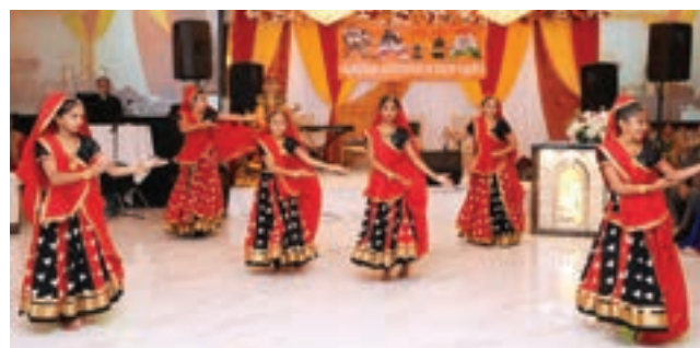
Women performing the famed Rajasthani folkdance Ghoomer

The event showcased the rich culture of Rajasthan through performances by Rajasthani children and women who graced the stage with traditional Rajasthani songs.