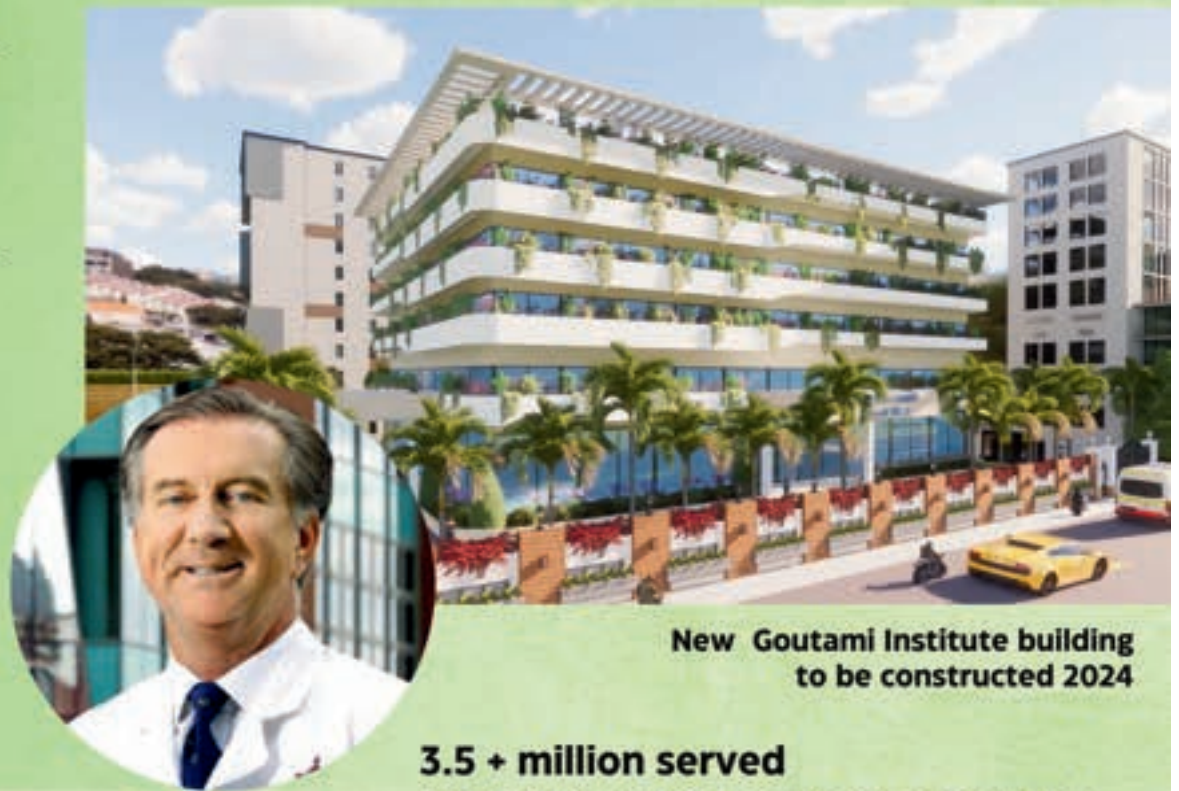
New Goutami Institute building to be constructed 2024