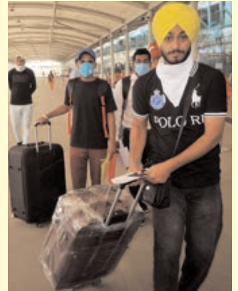
Canada to admit 5,00,000 immigrants each year; Indians to benefit most.