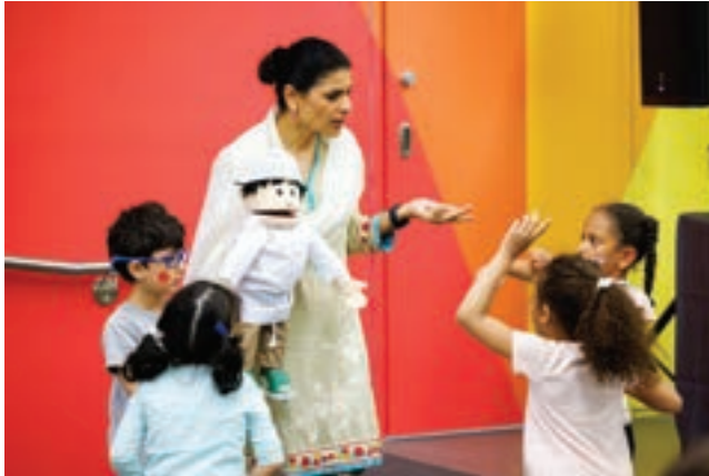
Brooklyn Children's Museum (BCM)

From 3-5pm, come aboard the Seaport Museum's 1885 tall ship Wavertree, where you can make your own decoration inspired by the marigold garlands of Diwali, signifying good fortune and faith in the divine, with a maritime twist. Continue the Seaport Museum's festivities on Pier 16, where you can decorate your own "diya lamp"-or, in this case, a candle-and then set it