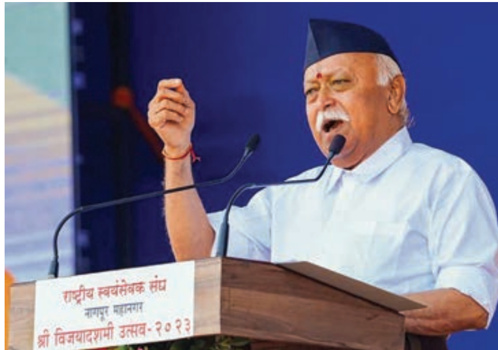
RSS chief Mohan Bhagwat recently attacked 'cultural Marxism' or 'wokeism'.

In his Dussehra address at the Ramlila Maidan on October 24, PM Narendra Modi called for the uprooting of casteism and regionalism that threatened to fracture the unity of 'Maa Bharati'. RSS chief Mohan Bhagwat, while addressing the Sangh's annual Vijayadashami event in Nagpur, attacked 'cultural Marxism' or 'wokeism' that presumably controlled the media and universities. These forces, he said, were