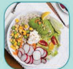
Yogik Healthy Vegan Food