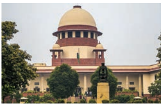
Supreme Court of India curbs ED's powers of arrest Image for representation only