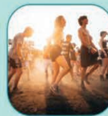
Yoga Dance & Music