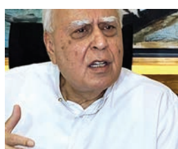
Rajya Sabha MP Kapil Sibal addresses a press conference in New Delhi.