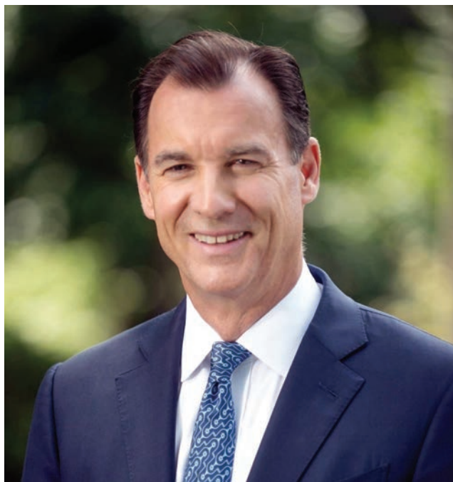
Political polarization is happening in our country as everybody thinks differently

The fourth problem, and the most dangerous one, is that our strategic adversaries, Russia, Iran, North Korea and others are using our freedom and our social media to whip up the debate in our country. And they're