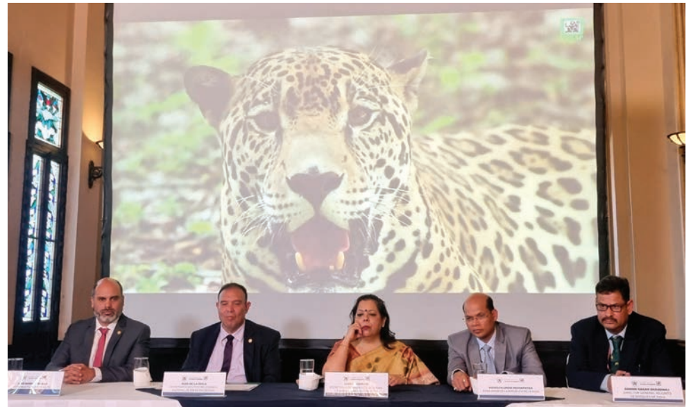
The event also featured video presentation of 50 Years of Project Tiger Reviving the Roar of the Big Cats