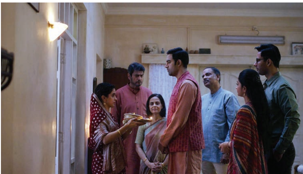
Closing Night film, 'Mrs.'

Opening Film "Dear Jassi" is directed by celebrated Indian American filmmaker Tarsem Singh, who has made films with Jennifer Lopez and Julia Roberts. Plus, he has directed videos for music legends like the bands R.E.M. and Lady Gaga.