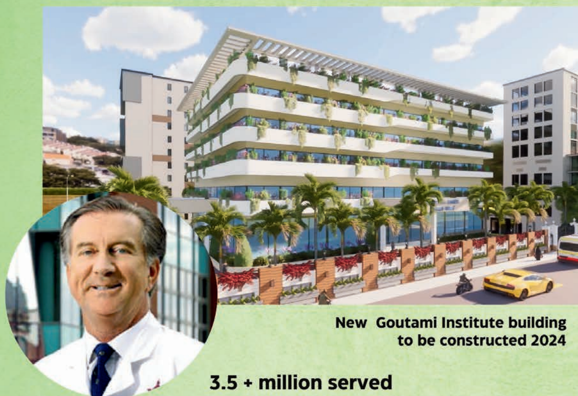
New Goutami Institute building to be constructed 2024