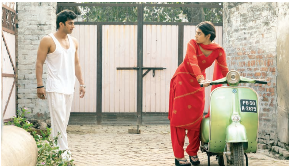
Opening Night film, 'Dear Jassi'

Several other well-known Indian film personalities will be featured in a wide array of works.