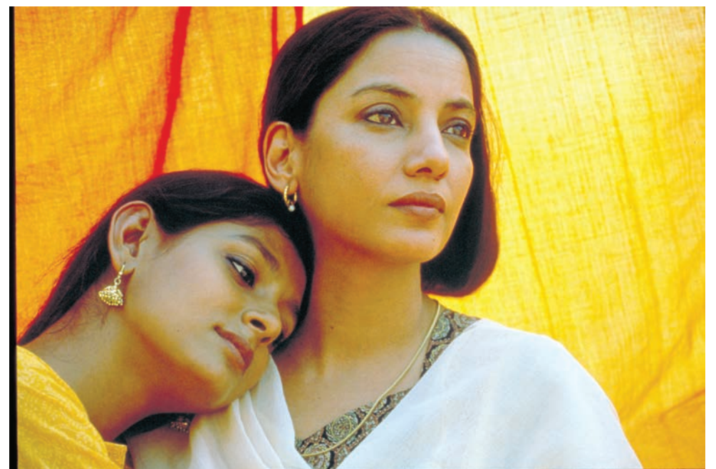
'Fire': (left) Nandita Das, Shabana Azmi

The screening of Fire will be followed by a conversation with Shabana Azmi and filmmaker Mira Nair.