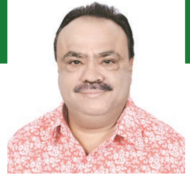
VEDIC ASTROLOGER NASTUR BEJAN DARUWALLA

Ganesha says you will have a great day. Some wonderful career opportunities may knock at your door, and it may take you some time to make the best decision of your life on the professional front. It's a wonderful day, so you should try to make the most of it.