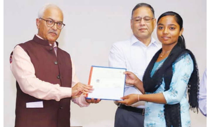
Union Home Secretary Ajay Kumar Bhalla hands over citizenship certificates to 14 people who applied for citizenship under CAA in Delhi.