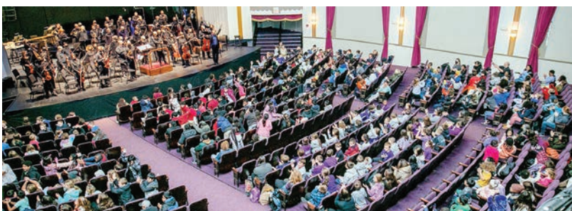
Family Concert

Discover what makes a live orchestra concert so special. The New Jersey Symphony takes a deep dive into Beethoven's "Eroica"- his breakout Third Symphony that broke all the rules and forged a new future for the symphonic form. Inspired by Leonard Bernstein's masterful way of putting young audiences at the center of music-making, this interactive concert will feature inside tips, listening cues and fun facts that make for the perfect Saturday afternoon family outing!