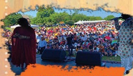
LIVE MUSIC CONCERT