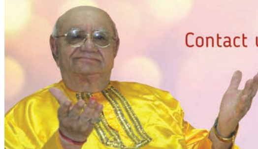
World Famous Astrologer Bejan Daruwalla