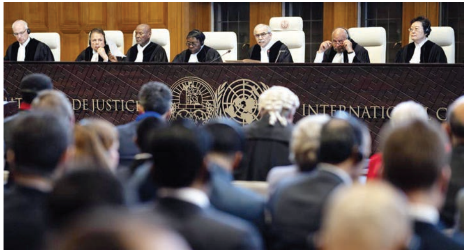
Presiding judge Nawaf Salam, third from right, opens the hearings at the International Court of Justice, in The Hague, Netherlands, on May 16, 2024.

IT IS THE FOURTH TIME SOUTH AFRICA HAS ASKED THE INTERNATIONAL COURT OF JUSTICE FOR EMERGENCY MEASURES ALLEGING THAT ISRAEL'S MILITARY ACTION IN ITS WAR WITH HAMAS IN GAZA AMOUNTS TO GENOCIDE