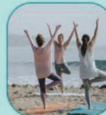
Surprise YOGA Celebrity