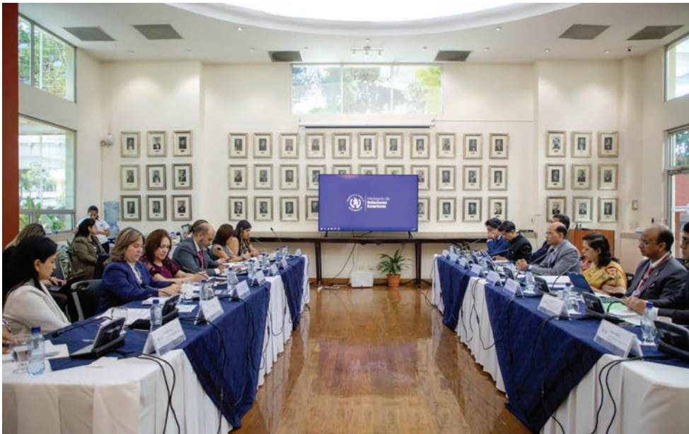
Members of delegation from both sides indulged in productive bilateral meetings