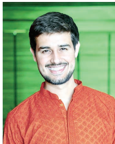
YouTuber Dhruv Rathee's video titled, "Is India becoming a DICTATORSHIP?", has already garnered 25 million views on YouTube.

Influencers with views that challenge the dominant narrative have been quick to catch on, helped by the algorithms. A feature of the algorithms used in YouTube and Facebook is that content that is growing quickly in popularity