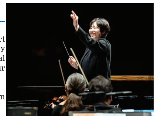
Xian Zhang