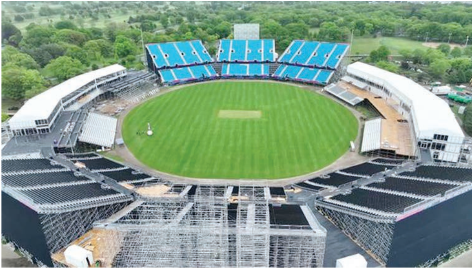
Nassau County's International Cricket Stadium was unveiled Wednesday, May 15, in Eisenhower Park