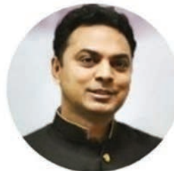
Prof. K. V. Subramanian India's Exec Director of to IMF