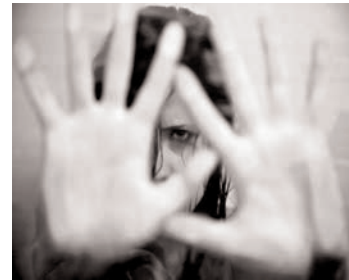
Rajpal Singh was accused of touching private parts of five women during yoga classes in 2019 and 2020