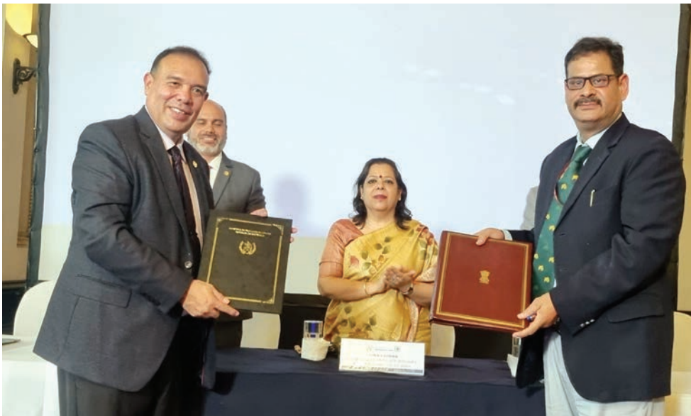
MOU on Conservation of the Tiger ( Panthera Tigris ) and the Jaguar ( Panthera Onca ) was signed between India and Guatemala